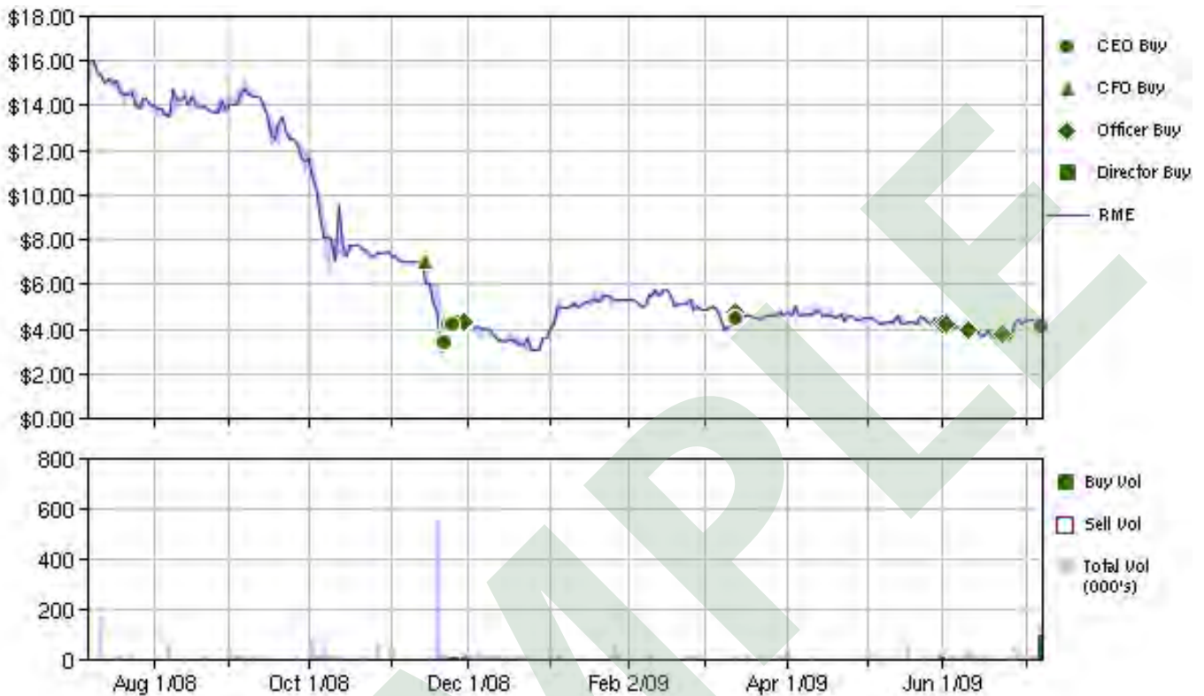
Chart reflects public-market and option-exercise transactions of common shares (unit trusts) by company officers and directors. USD transactions are converted to Canadian dollars by us using the Bank of Canada noon rate on the transaction date.